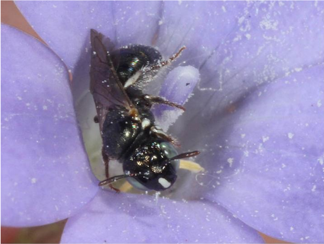
Figure 1: A close-up photo of Ceratina (Neoceratina) australensis , the Australian small carpenter bee.