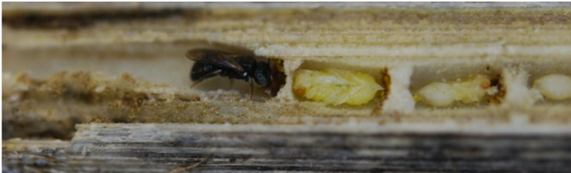
Figure 2: The nest of an Australian small carpenter bee in a giant fennel stem.