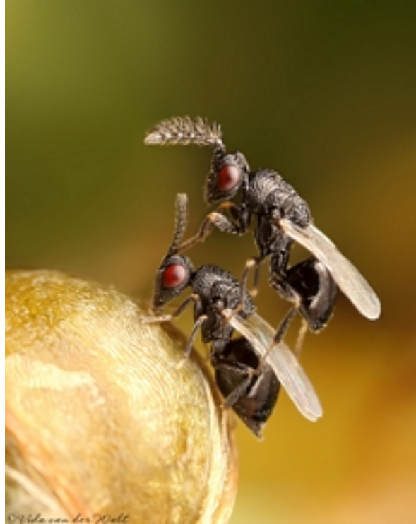
Figure 3: A species of chalcid wasps from the genus Eurytoma .